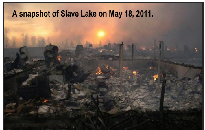
A snapshot of Slave Lake on May 18, 2011.